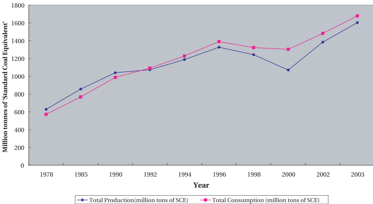
Figure I: China's Total Energy Production & Consumption, 1978-2003

consumers become able to afford electrical appliances, travel, and a wider range of services, demand is rising steeply in the residential and service (especially transport and telecommunications) sectors. Proportionally their combined consumption of oil has grown from 17.5% in 1990 to 31% in 2002, whilst industry, by contrast, has trimmed its share from 64% to 50% over the same period. Moreover, China is the fastest-growing, major automobile market in the world, but is producing only two-thirds of its crude oil needs. (table 2)